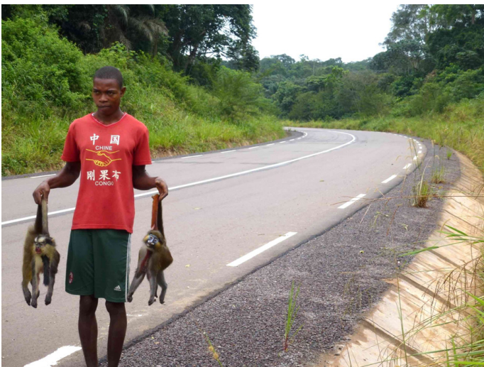
Figure 2. A poacher selling dead moustached monkeys ( Ceropithecus cephus ) for bushmeat along a Chinese-funded road cutting through a national park in the Republic of Congo. Many large development projects trigger uncontrolled secondary effects, such as wildlife poaching and illegal gold mining, that are not effectively countered by the EIA process.

On occasion, one even sees EIA consultants defending and promoting the project in public. In northern Queensland, Australia, for example, environmental experts