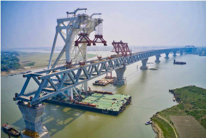
Figure 3. The Padma Bridge, a US$6.2 billion project, is heavily impacting the world's largest mangrove forest in Bangladesh.

ronmental values and biodiversity, b) long-term monitoring and habitat rehabilitation after the project is completed, and c) insurance coverage for unexpected project disasters.